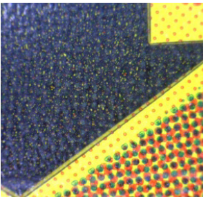
AFP™-TSP - Good trapping of overprint colours

A key feature of these CleanPrint plates is their smooth, homogeneous ink transfer versus conventional plates. The ink transfer looks particularly good with regard to the trapping behaviour when different colour inks are printed on top of each other.